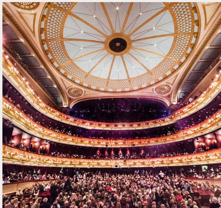
Auditorium of the Royal Opera House

Whether you are new to ballet and opera or have loved them all your life, we trust you'll find plenty to enjoy among the line-up this season. See you at the cinemas.